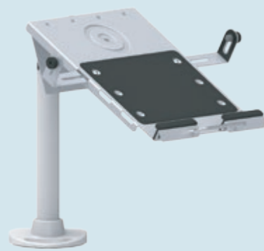
Laptop Holder EGDF-A05 (for Easyfly Series) W290~450xD375xH161

The goal of LCD monitor arm is to create optimum comfortable and healthy living and working conditions. Great care and fastidiousness are placed in the details of our designs. This LCD monitor arm reviews a number of techniques for avoiding work-related, repetitive stress injuries, long-term incorrect postures & positions and enhancing both the comfort and productivity levels of the workers who adopt them.