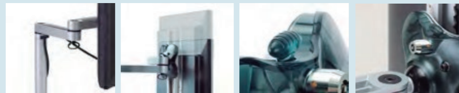
Cable management Height adjustment Quick release Anti-theft kit